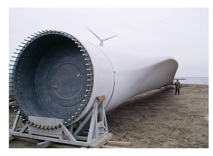
Rotor blade NDT inspections with Shearography

Shearography has been incorporated in ASNT standards since 2006. NAS 410 Certified since 2008. (SNT-TC1-A, and CP-105). ASTM standard (ASTM E2581) defines how to inspect composites with shearography. Laser shearography has been approved by leading suppliers in the aerospace, automotive, wind turbine and other industries.